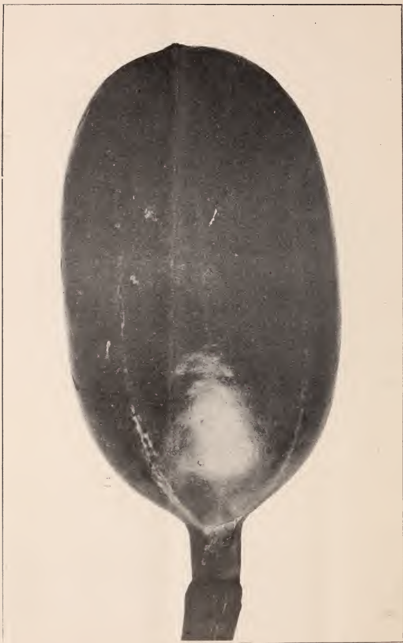
CALYCOPHYSUM BREVIPES PITTIER.